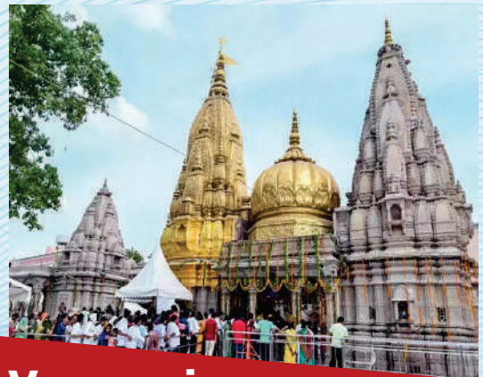
Varanasi (Kashi Vishwanath)

Varanasi (Kashi) , the spiritual heart of India, hosts the magnificent Kashi Vishwanath Temple, dedicated to Lord Shiva. It offers an immersive experience of ancient rituals along the Ganges and timeless serenity.