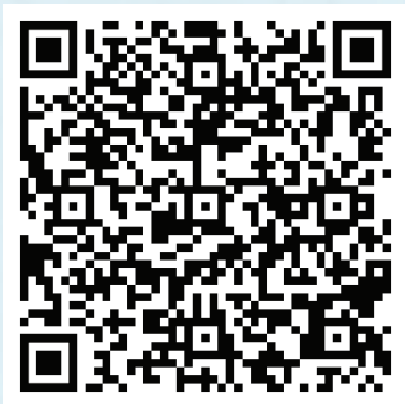
Scan for Registration form

Registration form link- https://docs.google.com/forms/d/e/1FAIpQLSdQXdE9zxE7V6cRzArcl0AQUKjXbcmghv9IQoNcd8nprJrcSg/viewform?usp=header